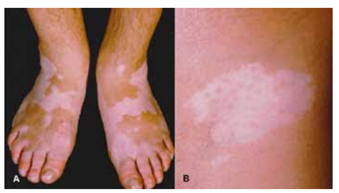
Figure 1: (A) Generalized vitiligo characterized by symmetrical depigmented milky white patches affecting the dorsa of feet, (B) Response to photochemotherapy that appears as perifollicular repigmentation that gradually increases in size to cover the depigmented area.