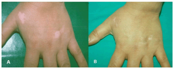
Figure 4: (A) generalized vitiligo showing few localized lesions of the dorsa of the hands, (B) Following the suction blister procedure there is a uniform color covering almost all the depigmented lesions. The small uncovered depigmented areas respond well to photochemotherapy.

of the entire integument) depigmentation of normally pigmented skin seems plausible [23].